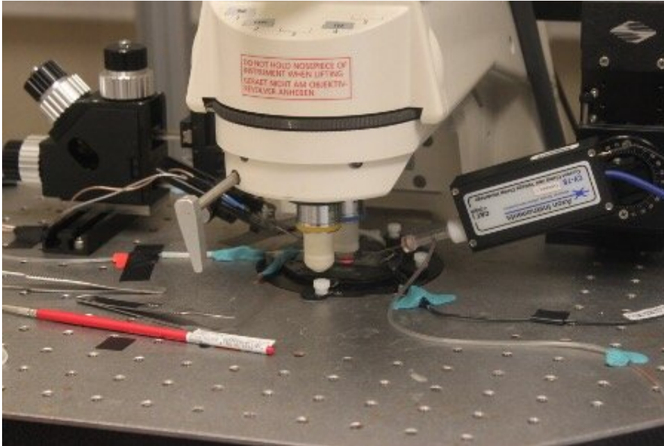
Image of the electrophysiology equipment used in the current paper.

how pain is perceived and expressed on an emotional level .