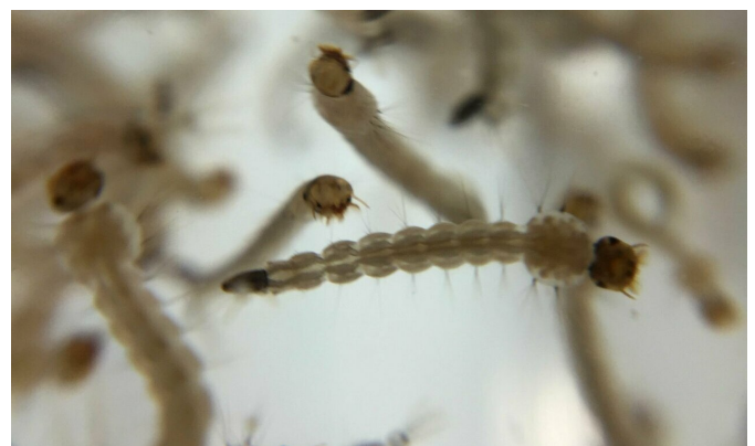
Aedes aegypti mosquito larvae.

The results of the new study will help scientists to track mutations linked to resistance in populations of the Yellow fever mosquito from Southeastern Mexico. This knowledge can help scientists understand how mosquitoes have evolved resistance and when a population can no longer be controlled with permethrin. This understanding will be necessary to develop tools to support future insecticide management strategies.