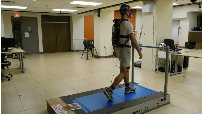
Soft exoskeleton on treadmill.