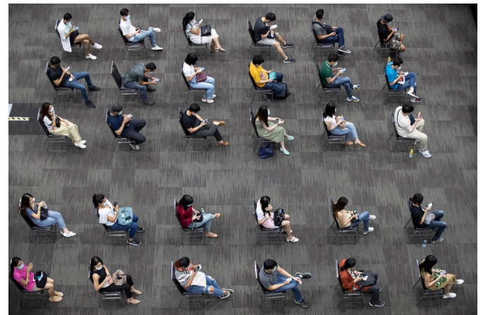
Airline employees sit after receiving the Sinovac COVID-19 vaccine to be sure of no side effects at the Siam Paragon shopping mall in Bangkok, Thailand, Tuesday, May 25, 2021.

The government has shut all schools, prohibited dining in restaurants and banned social activities and inter-state travel, but has resisted calls for a full lockdown because of fears it would cause an economic catastrophe.