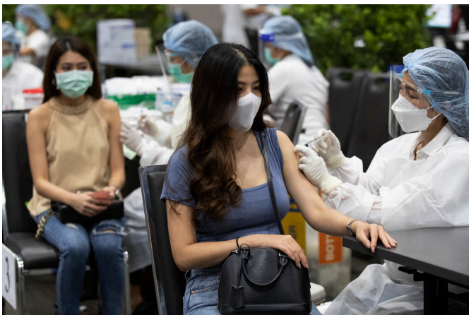
Health workers administer shots of the Sinovac COVID-19 vaccine for airline employees at Siam Paragon shopping mall in Bangkok, Thailand, Tuesday, May 25, 2021.

The outbreak has spilled into Thailand, which has locked down several southern villages along the Malaysian border after identifying infections involving the South African variant that is thought to be more contagious. It was believed to have been spread by an infected person who crossed the border from Malaysia.