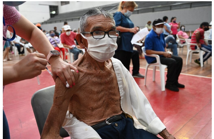
A man is inoculated with the Sputnik V vaccine against Covid-19 in San Lorenzo, Paraguay on May 21 2021.