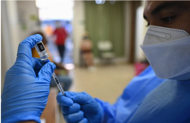
A nurse prepares a dose of the Pfizer vaccine on Taboga Island in Panama on May 21, 2021.

Latin America and the Caribbean passed one million coronavirus deaths on Friday as the IMF proposed a $50 billion plan to end the pandemic, aiming to expand global immunization drives.