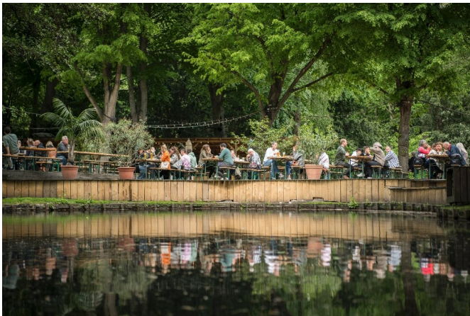
People enjoy sunny weather at a beer garden in Berlin on May 21, 2021.

Leading COVID vaccine makers Pfizer, Moderna and Johnson & Johnson promised 3.5 billion doses at cost or discount to middle- and low-income countries this year and next.