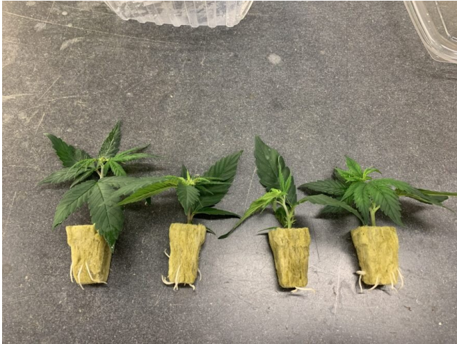
Cannabis shoots in culture. UConn researchers are pioneering micropropagation techniques for cannabis.

As nurseries and garden centers fill up with spring landscaping plants, home gardeners owe a lot to a technique called micropropagation, which has proven beneficial to many plants—perhaps soon to include cannabis, thanks to work by UConn researchers in the College of Agriculture, Health, and Natural Resources.