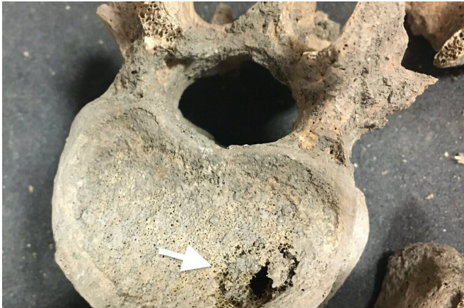
Excavated medieval bone from the spine showing cancer metastases (white arrow).

The first study to use X-rays and CT scans to detect evidence of cancer among the skeletal remains of a pre-industrial population suggests that between 9-14% of adults in medieval Britain had the disease at the time of their death.