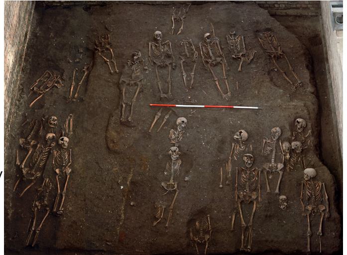
The remains of numerous individuals unearthed on the site of the former Hospital of St. John the Evangelist.

The researchers also point to the cancerous effects of pollutants that have become ubiquitous since the industrial revolution of the 18th century, as well as the possibility that DNA-damaging viruses are now more widespread with long-distance travel. Moreover, our longer lifespans give cancer much more time to develop.