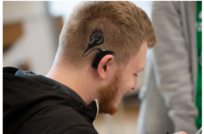
A young man with a cochlear implant. The cochlear implant is considered the most successful neuroprosthesis, providing speech understanding in quiet background to more than 700,000 users worldwide.