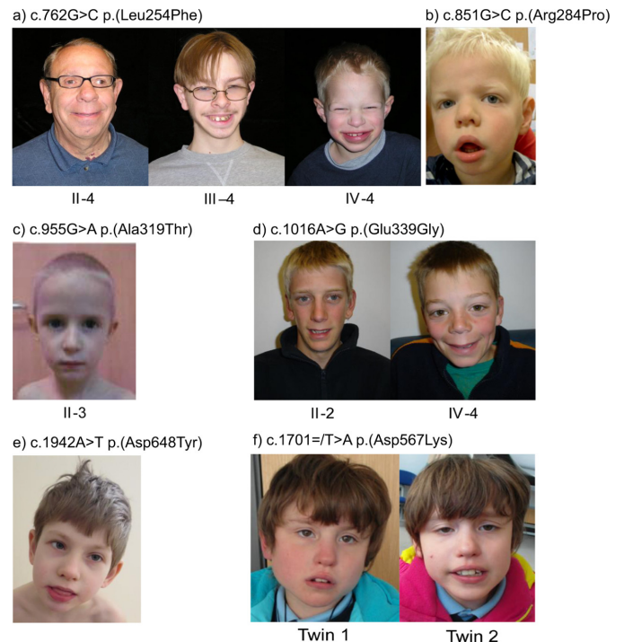
Fig. 2: Facial photographs of patients with variants in OGT.