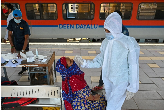
A woman gets a Covid test in Mumbai, India