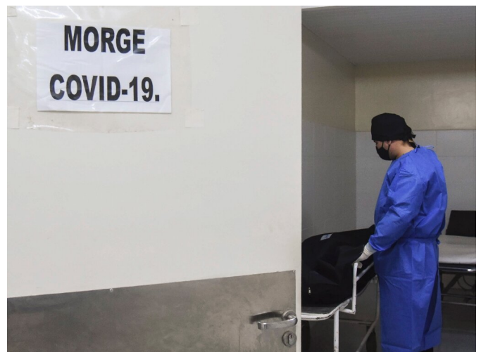
A healthworker at a morgue in Paraguay

"They often have to be intubated and then face a long fight with the virus."