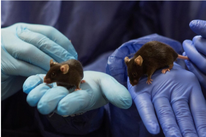
Mutated mice used in the mouse model.

People with PKU have mutations in PAH, which results in misfolded, dysfunctional PAH. This leads to the accumulation of toxic levels of Phe in the blood and brain and a Phe-free diet is initiated immediately after diagnosis.