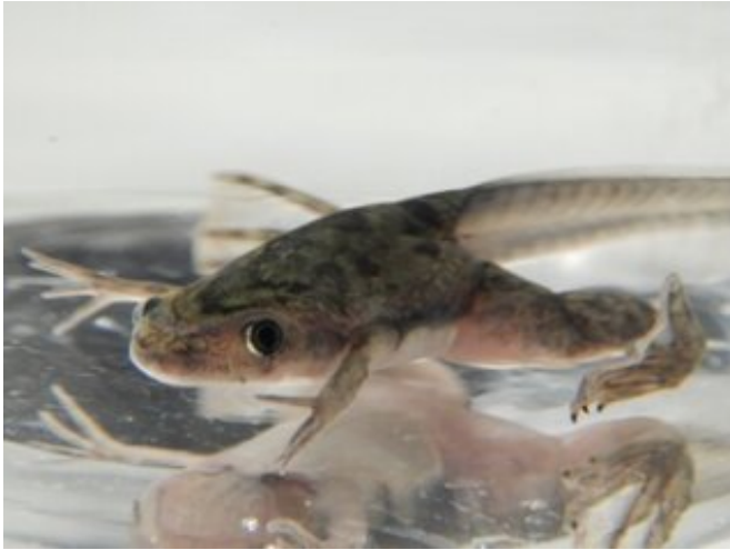
Xenopus froglet finishing metamorphosis. Credit: Gretel Nicholson, EXRC

Scientists have discovered a new genetic disease, which causes some children's brains to develop abnormally, resulting in delayed intellectual development and often early onset cataracts.