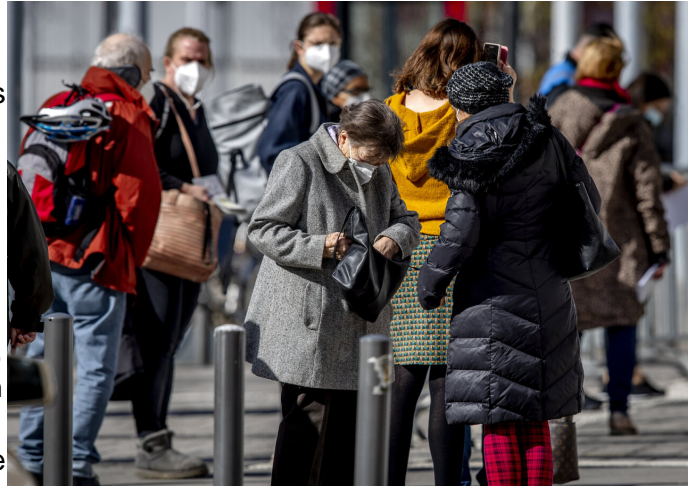
People wear face masks as they queue in front of the vaccination center in Frankfurt, Germany, Monday, March 29, 2021.

Germany's decision is likely to affect appointments made by tens of thousands of teachers and people with pre-existing conditions who received invitations to get vaccinated in Berlin in recent days. Appointments for the AstraZeneca shot were available sooner than for those made by Pfizer-BioNTech and Moderna due to higher demand for those vaccines.