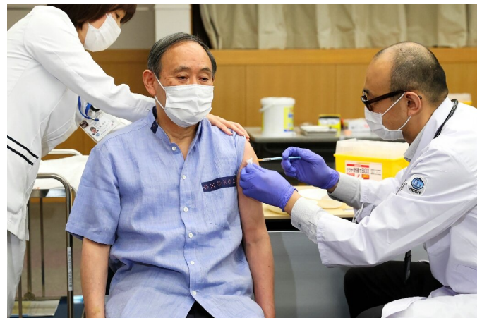
Japan's Prime Minister Yoshihide Suga received his vaccine on Tuesday

Indonesia delayed its AstraZeneca rollout on Monday, and Venezuela announced it would not authorise the jab over fears of "complications".