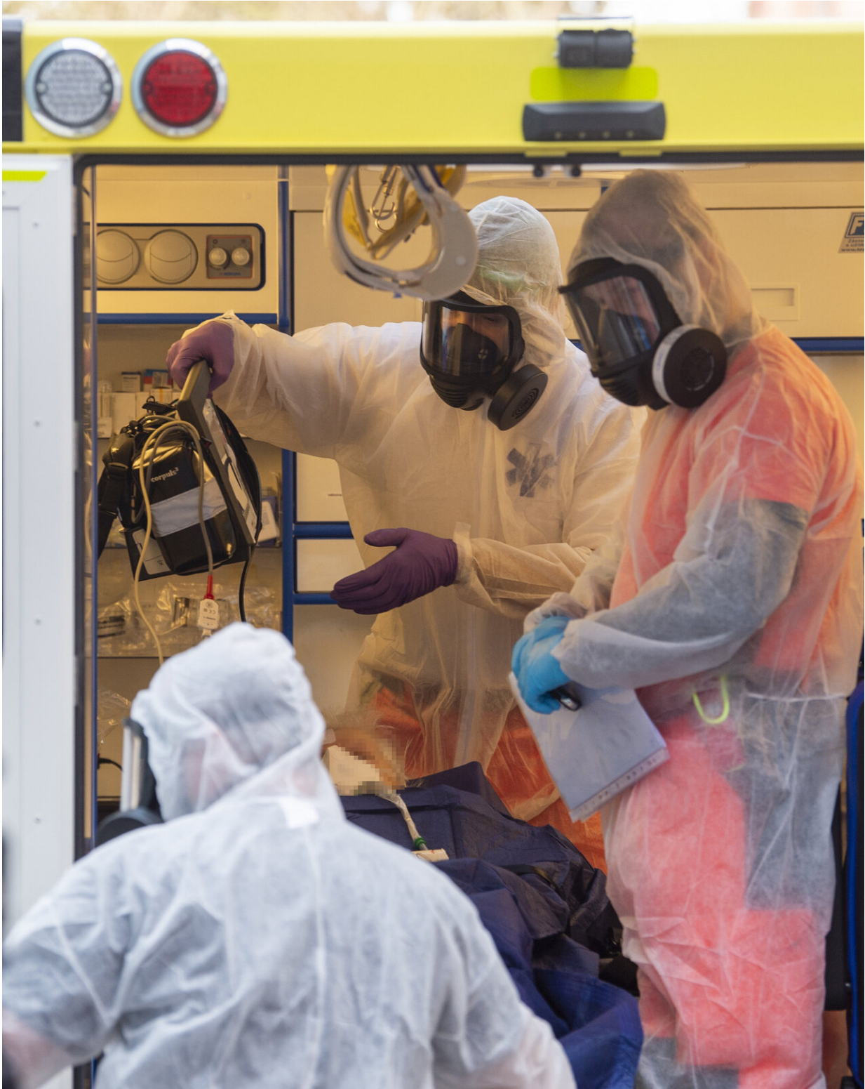
Paramedics transport a patient with COVID-19 disease from the Usti nad Orlici Hospital, Czech Republic, to the Raciborz Hospital in Poland, on March 9, 2021.