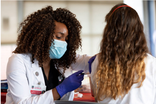
A pharmacy student administers a vaccine at the mobile flu shot clinic in the Walker Room at Rusk Hall. The clinic is sponsored by the University Health Center and the College of Pharmacy.

More U.S. adults reported receiving or planning to receive an influenza vaccination during the 2020-2021 flu season than ever before, according to findings from a national survey.