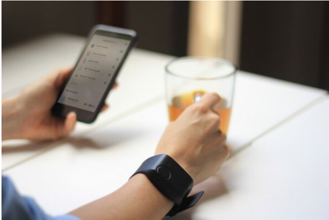
The wearable device being tested for COVID-19 detection.

University of Miami Miller School of Medicine researchers are recruiting health care workers to study whether a wearable device, a wristwatch, can capture real time data that can be used to alert wearers of subtle physiological changes that may indicate they have become infected with COVID-19.