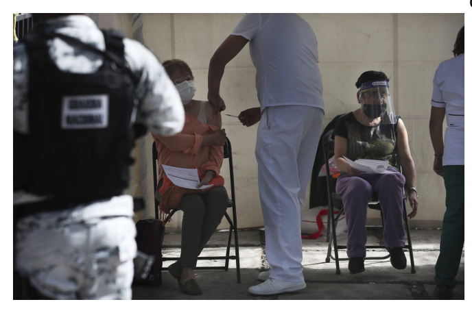
A woman gets her shot of the AstraZeneca COVID vaccine at the Magdalena Contreras borough of Mexico City, Tuesday, Feb. 16, 2021, as Mexico begins to vaccinate people over the age of 60 against the new coronavirus.

Mexico topped 2 million confirmed coronavirus cases and 175,000 deaths related to COVID-19 on Tuesday, though officials concede that the country's extremely low rate of testing means the real figures are much higher.