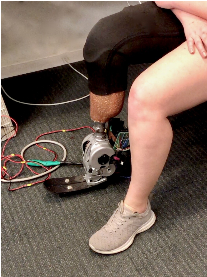
MIT researchers in collaboration with surgeons at Harvard Medical School have devised a new type of amputation surgery that can help amputees better control their residual muscles and receive sensory feedback.