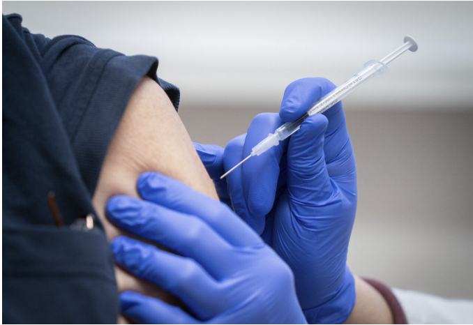
Nurse gives an injection with the Biontech/Pfizer vaccine against Covid-19 disease to an employee at the Bethel Hospital in Berlin, Germany, Wednesday, Jan. 13, 2021. A total of 66 employees will be vaccinated at the hospital with the first the Biontech/Pfizer vaccine.