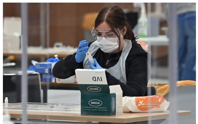
A worker wearing PPE processes a Covid-19 test on a swab taken from a student returning to Hull University

Officials underlined the severity of the spread now compared to last spring, owing to the variant which emerged in southeast England.