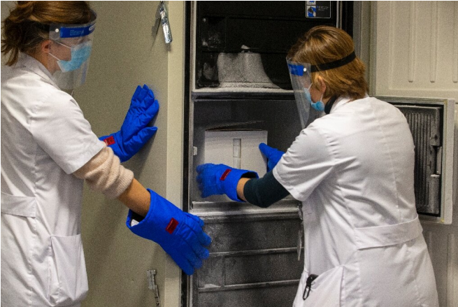
Staff at Belgium's UZ Leuven hospital pack a delivery of coronavirus vaccine into an ultra-low-temperature freezer

The European Union teed up a vaccine rollout Saturday, even as countries in the bloc were forced back into lockdown by a new strain of the virus, believed to be more infectious, that has spread from Britain to France and Spain and even as far as Japan.