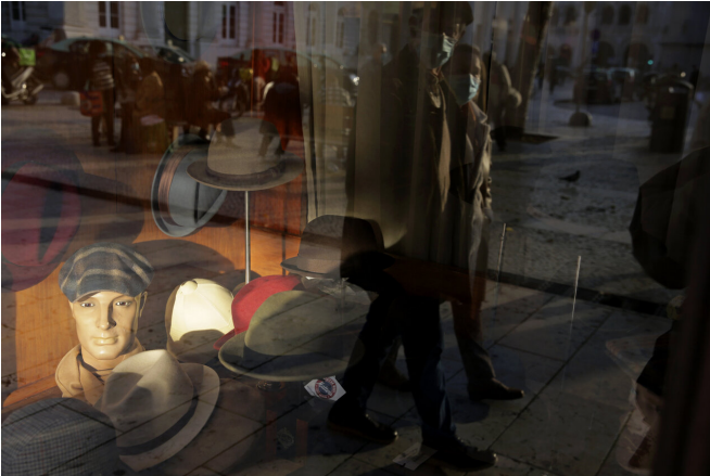
A couple wearing face masks are reflected on the window of a hat shop in downtown Lisbon, Wednesday, Dec. 2, 2020.

Portugal is aiming to vaccinate almost 1 million people against the coronavirus between January and April at the latest, and perhaps by the end of February, depending on the pace of vaccine deliveries, officials said Thursday.