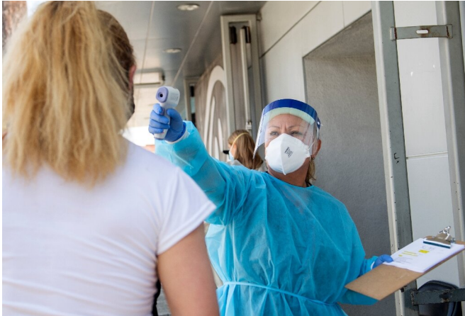
A health worker takes a patient's temperature before their test in Los Angeles, California

A restaurant dining ban in Los Angeles was due to come into force Wednesday as officials warned Americans to stay home for the Thanksgiving holiday, while parts of Europe eyed looser coronavirus lockdowns over the festive season.