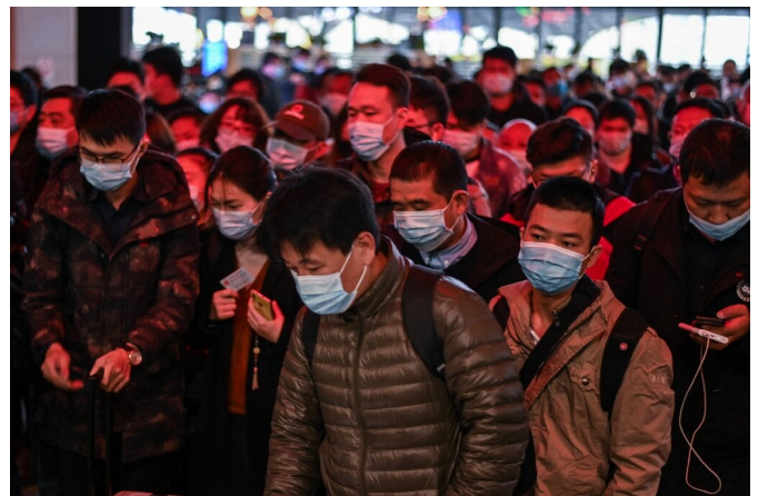
Passengers wearing face masks walk to their train at the main railway station in Wuhan, China

Singapore, which has one of the world's lowest virus death rates, announced it had no live clusters of COVID-19 cases in the country—the first time since its outbreak began earlier this year.