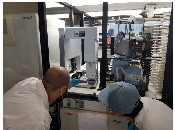
Researchers develop new protocol for COVID-19 testing technique

The researchers demonstrated reliable ultra-sensitive and quantitative detection of low SARS-CoV-2 viral loads (less than one copy/microliter) using synthetic viral RNA, clinical nasopharyngeal swab samples and saliva samples, including samples previously diagnosed as negative by clinical diagnostic testing. Their findings, reported in the journal Processes are that this microfluidic RT-PCR assay is a sensitive, quantitative, and cost-effective detection strategy which could markedly reduce the false negative rate of clinical diagnostic tests—a potentially valuable tool in SARS-CoV-2 active screening and early detection programs.