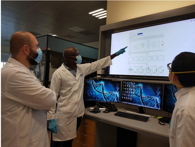
Researchers develop new protocol for COVID-19 testing technique

One critical barrier in efforts to control the COVID-19 pandemic has been the relatively high false-negative rate of the most commonly-used Reverse Transcription Polymerase Chain Reaction (RT-PCR) testing methods.