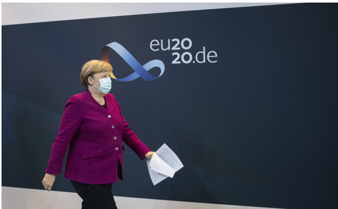
German Chancellor Angela Merkel leaves after a press conference following a meeting of the governors of the German states on the coronavirus situation in Berlin, Germany, Tuesday, Oct. 14, 2020.

This week has seen the Netherlands close bars and restaurants and the Czech Republic and Northern Ireland close down schools. The Czech Health Ministry said the country, with a population of over 10 million, confirmed 9,544 new cases on Wednesday—over 900 more than the previous record, set less than a week ago. The government says hospitals could reach full capacity by the end of October.