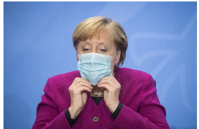
Angela Merkel also announced tougher measures on mask-wearing

And in Italy, authorities recorded 7,332 new cases on Wednesday—the highest daily count the hard-hit country has yet seen.