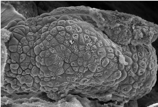
Ovarian cancer cells forming a cancer spheroid as they grow within the peptide-protein co-assembling material.

Scientists have created a three-dimensional (3-D) tumor model in the laboratory for ovarian cancer that could lead to improved understanding and treatment of the disease.