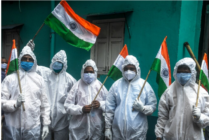
Indians on the coronavirus frontline such as medics and crematorium workers wear personal protective equipment as they mark Independence Day celebrations in Kolkata