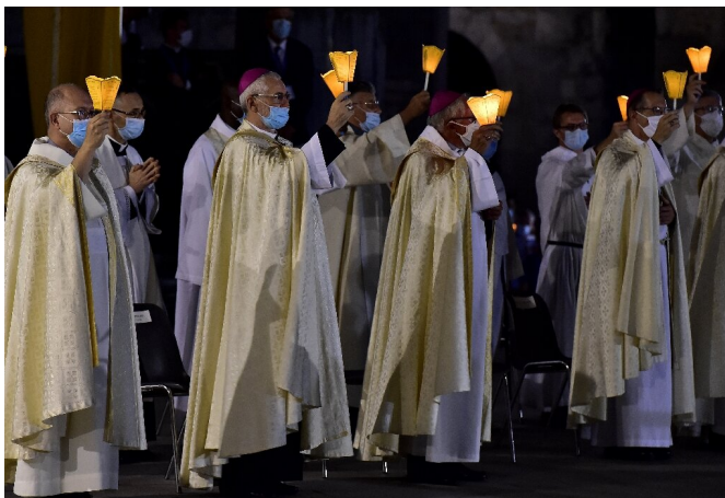
Prelates wearing face masks hold candles as they attend the 147th Assumption pilgrimage mass in France's Lourdes shrine on August 14, 2020