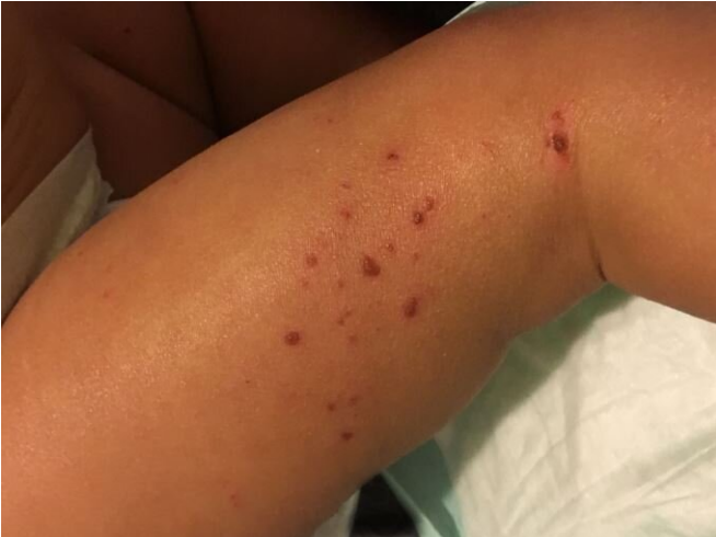
Limb of a young child who is experiencing the dry, itchy skin associated with eczema, also called atopic dermatitis.

New research supported by the National Institutes of Health delineates how two relatively common variations in a gene called KIF3A are responsible for an impaired skin barrier that allows increased water loss from the skin, promoting the development of atopic dermatitis, commonly known as eczema. This finding could lead to genetic tests that empower parents and physicians to take steps to potentially protect vulnerable infants from developing atopic dermatitis and additional allergic diseases.