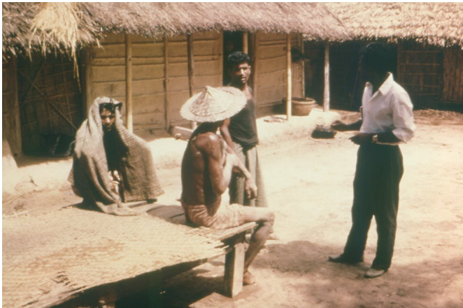
In 1977, a health care field worker conducts a house-to-house search for possible smallpox-infected inhabitants.

The last known natural case of smallpox occurred in Somalia in 1977, and in May 1980 the World Health Assembly declared the disease officially eradicated . And that was the end of smallpox in the wild.