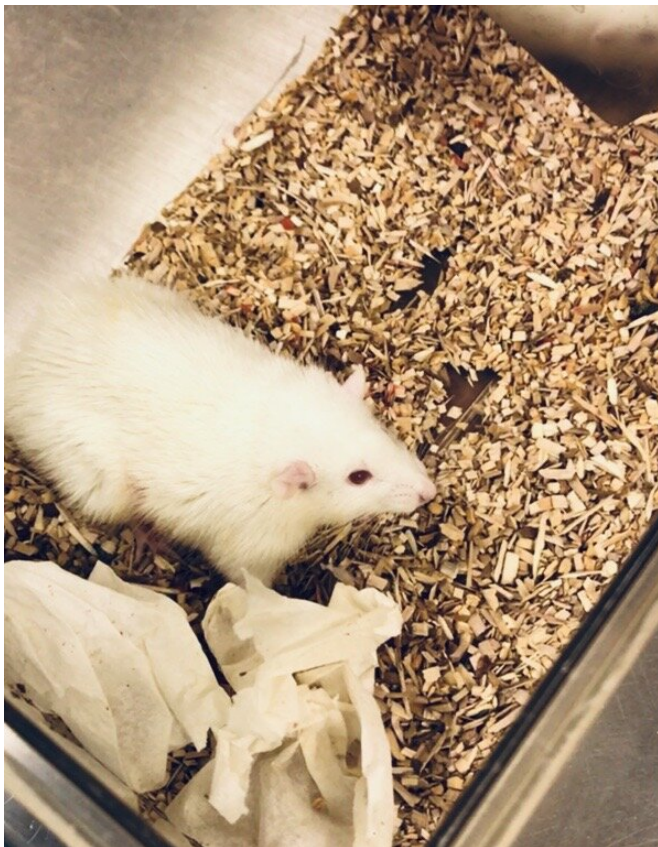
This rat received a transplanted lab-grown miniature liver.

Using skin cells from human volunteers, researchers at the University of Pittsburgh School of Medicine have created fully functional mini livers, which they then transplanted into rats.