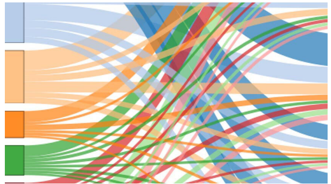
A graphical depiction of a figure showing how various pathways are involved in multiple cancer types.

"The good thing is this is a very dynamic process. We can have this whole system set up in a computer. As new patients come in or new data comes in, you can keep adding it," says Rupam Bhattacharaya, M.Stat., a doctoral student and first author on the paper.