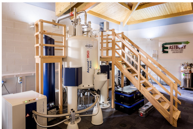
The powerful 950 MHz nuclear magnetic resonance machine that allowed researchers to make their discovery.

"Finding a previously over-looked target to focus future efforts on is very exciting.