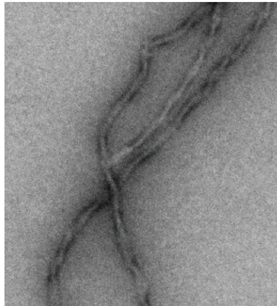
Tau fibrils.