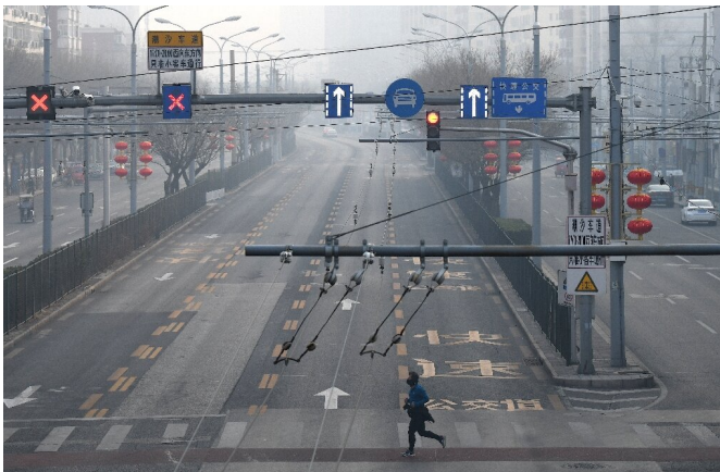
Beijing has suspended long-distance bus services into and out of the capital

Animal rights groups called for the ban to be made permanent, saying it could end the possibility of future outbreaks.