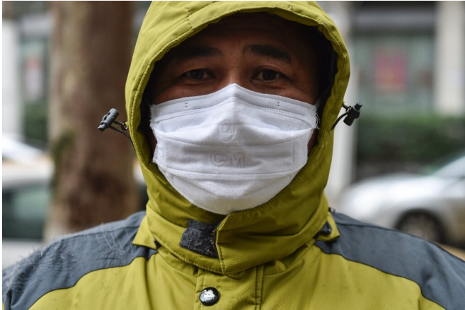
A man working as a volunteer delivering medicine waits outside a pharmacy in Wuhan

China expanded drastic travel restrictions Sunday to contain an epidemic that has killed 56 people and infected nearly 2,000, as the US, France and Japan prepared to evacuate their citizens from a quarantined city at the outbreak's epicentre.