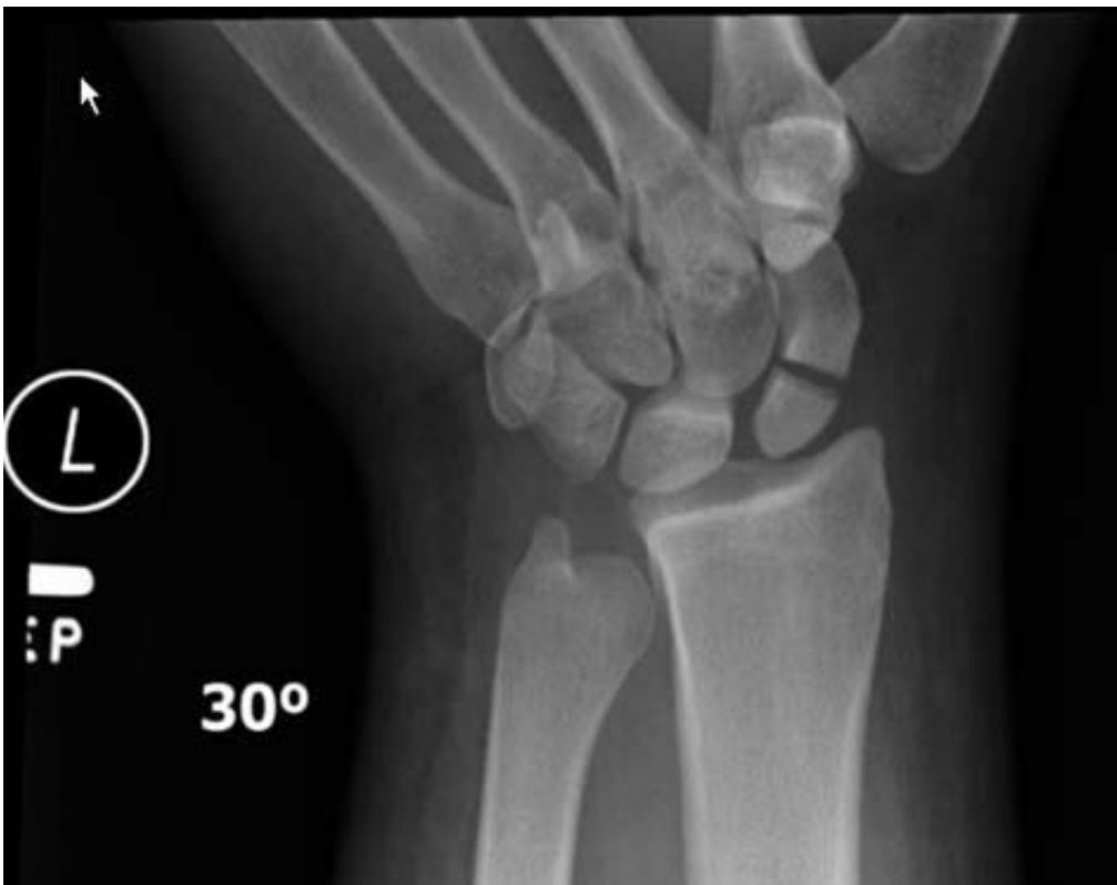
X-ray image of a fracture of the scaphoid bone in the left wrist.