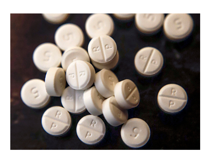
This June 17, 2019, file photo shows 5-mg pills of Oxycodone. At least a half-dozen companies that make or distribute prescription opioid painkillers are facing a