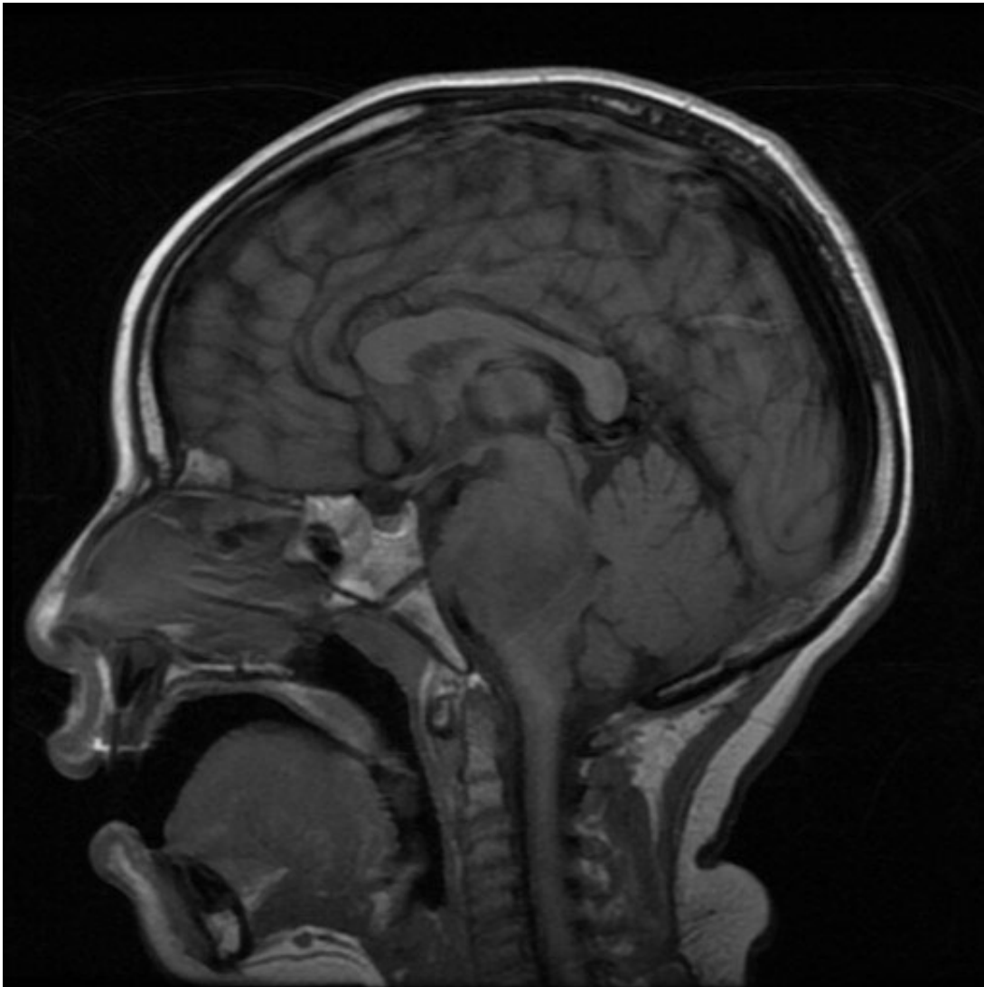
MRI scan (FLAIR sequence) depicting diffuse intrinsic pontine glioma (sagittal image) in a six-year-old child.

then tested the most effective single agents in various combinations.