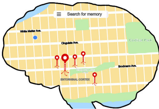
Conceptual illustration of neurons that "map" memories in the human brain. Credit: Salman Qasim/Columbia Engineering

The team measured the activity of neurons as the patients moved through the environment and marked their memory targets. Initially, they identified purely spatially tuned neurons similar to "place cells" that always activated when patients moved through specific locations, regardless of the subjects' memory target. "These neurons seemed only to care about the person's spatial location, like a pure GPS," says Salman E. Qasim, Jacobs' Ph.D. student and lead author of the study.