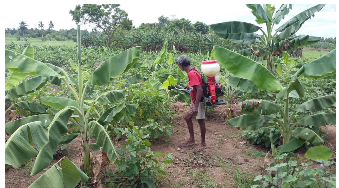
A Sri Lankan man spraying crops with pesticide.

This study is the first systematic review of the