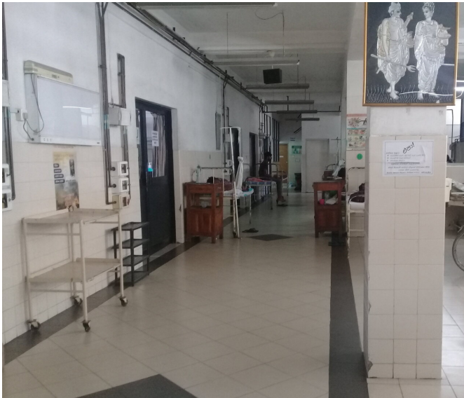
A psychiatric ward in Sri Lanka.

"Of course, the treatment of underlying psychiatric illness is important but prevention efforts should also incorporate a wider range of activities which aim to reduce access to lethal means, poverty, domestic violence and alcohol misuse. For example, population level solutions, such as banning highly toxic pesticides, have been shown to be effective in reducing the number of suicide deaths."