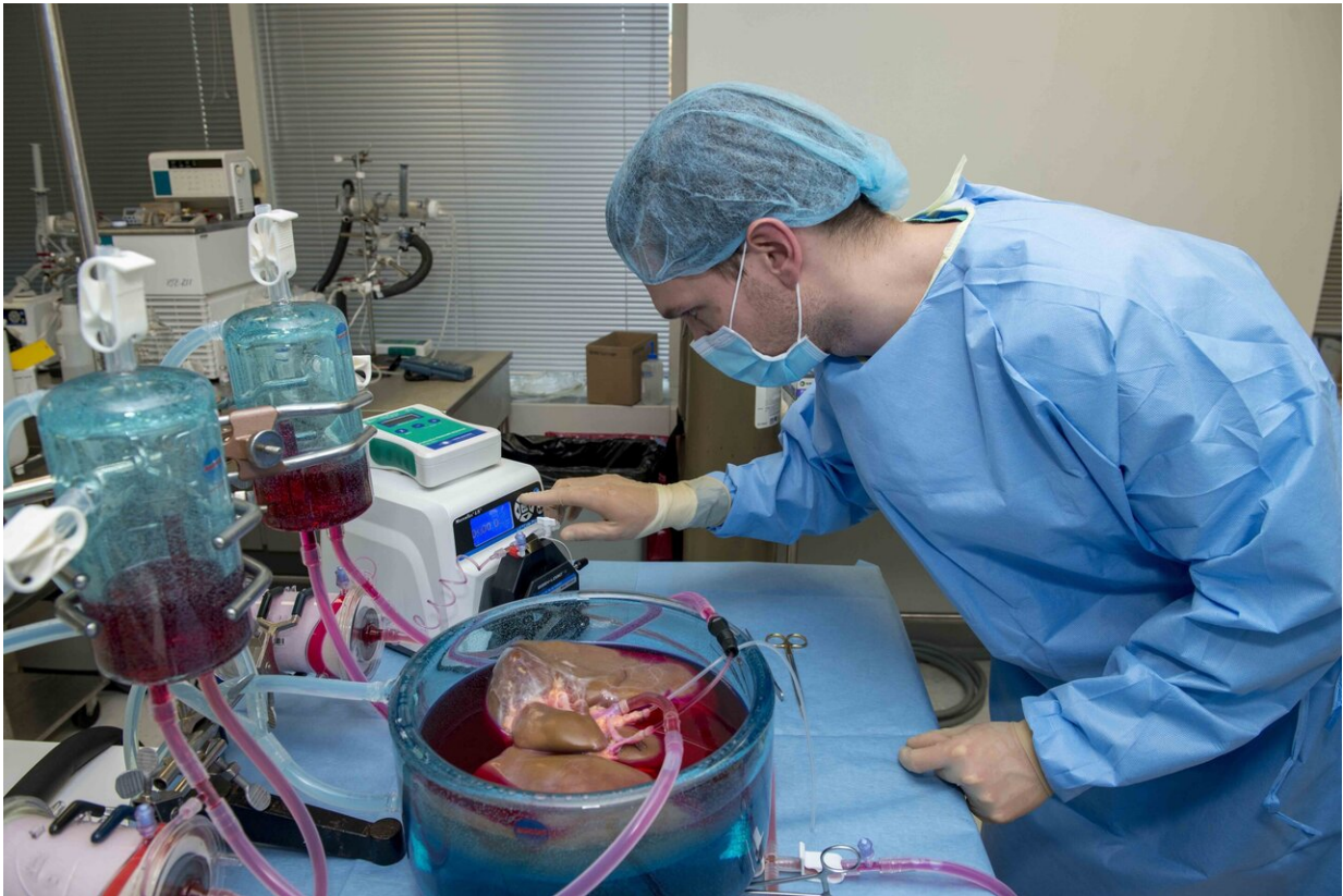
A machine perfusion process helps supercool human liver without freezing the tissue.

Prior to supercooling, the livers are conditioned to protect them from the cold with a preservative "cocktail" that is delivered via machine perfusion, another technique already in use to improve organs for transplantation. The perfusion ensures that the preservative solution is evenly distributed throughout the organ.