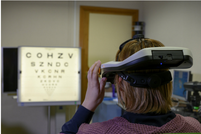
The new system SimVis

For the first time, patients will be able to experience how their vision will improve after cataract surgery, just before surgery. Thanks to a new wearable visual simulator developed by scientists from the National Research Council (CSIC), patients and surgeons are able to see the effects of an intraocular multifocal lens, which allows seeing at different distances, in a realistic way before being implanted.