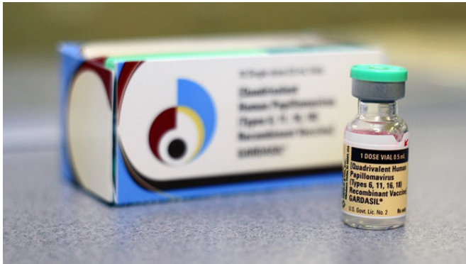
Human papillomavirus (HPV) vaccine.

It's nearly a decade since the human papillomavirus (HPV) vaccine was first introduced in the UK to help protect against the virus that causes most cases of cervical cancer. But until now, it has only been routinely offered to girls.