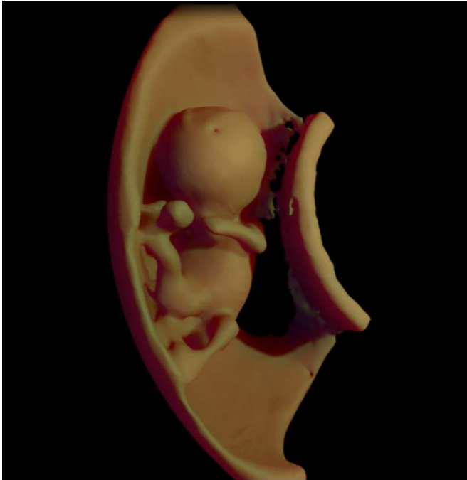
Figure 1: 3-D virtual model ultrasound view of fetus at 12 weeks.

Parents may soon be able to watch their unborn babies grow in realistic 3-D immersive visualizations, thanks to new technology that transforms MRI and ultrasound data into a 3-D virtual reality model of a fetus, according to research being presented next week at the annual meeting of the Radiological Society of North America (RSNA).