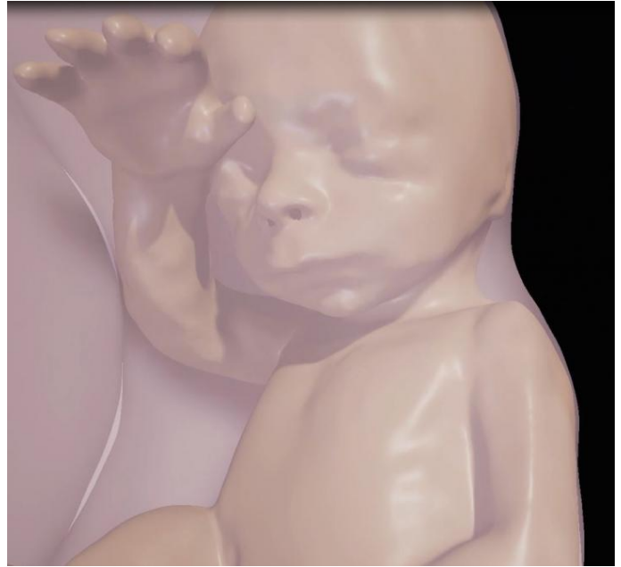
Figure 3: A close-up of fetus at 26 weeks.

The technology also can help coordinate care with multidisciplinary teams and provide better visual information to parents to help them understand malformations and treatment decisions.