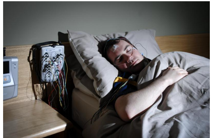
The Sleep and Pain Lab at the University of Warwick.

The results show that the scale was vital in predicting patients' level of insomnia and pain difficulties. With better sleep, pain problems are significantly reduced, especially after receiving a short course of CBT for both pain and insomnia.