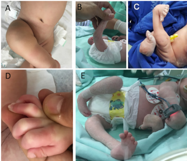
Clinical pictures of children with arthrogryposis.

A study published by The BMJ today provides more details of an association between Zika virus infection in the womb and a condition known as arthrogryposis, which causes joint deformities at birth, particularly in the arms and legs.