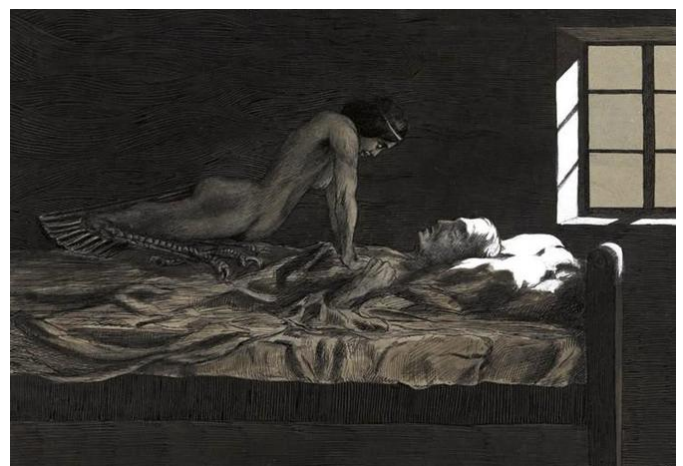
Sleep paralysis. My Dream, My Bad Dream, 1915.

About half of us will experience at least one lucid dream in our lives. And it could be something to look forward to because it allows people to simulate desired scenarios from meeting the love of their life to winning a medieval battle. There is some evidence that lucid dreaming can be induced , and a number of large online communities now exist where users share tips and tricks for achieving greater lucidity during their dreams (such as having dream totems, a familiar object from the waking world that can help determine if you are in a dream, or spinning around in dreams to stop lucidity from slipping away).