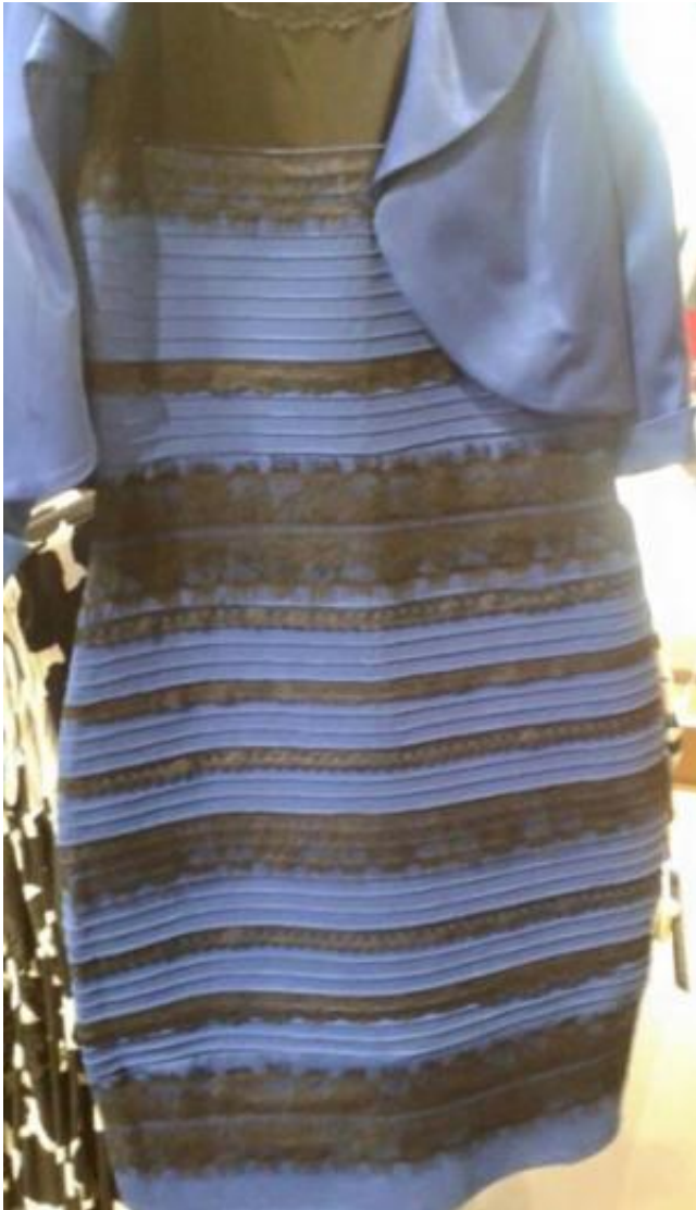
The dress, originally posted on the blogging website Tumblr.

saw gold and white while others insisted the dress is blue and black. Some people claimed they could see either interpretation, but only one of them at a time. It made people stop and ask, "What exactly is going on with this image?"