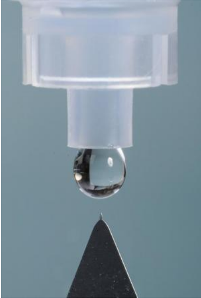
A solid microneedle coated with medication for delivery into the cornea is shown next to a liquid drop from a conventional eye dropper.

Glaucoma results from elevated pressure inside the eye that can be treated by reducing production of the aqueous humor fluid in the eye, increasing flow of the fluid from the eye, or both. Glaucoma is now controlled by the use of eye drops, which must be applied daily. Studies show that as few as 56 percent of glaucoma patients follow the therapy protocol.