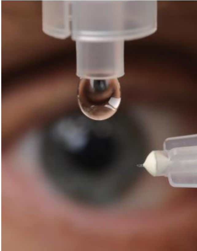
A microneedle used to inject glaucoma medications into the eye is shown next to a liquid drop from a conventional eye dropper.

as far as needed to deliver the drugs to internal spaces within the layers of the eye. For the glaucoma drug, for instance, the needle is only about half a millimeter long, which is long enough to penetrate through the sclera, the outer layer of the eye , to the supraciliary space.